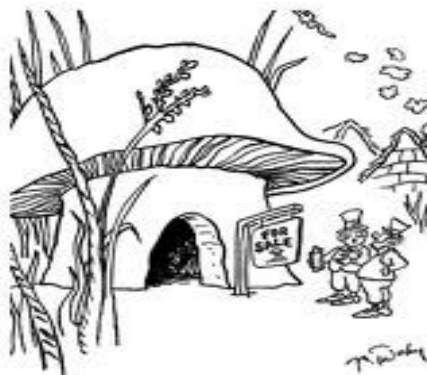
“One hundred percent green!”